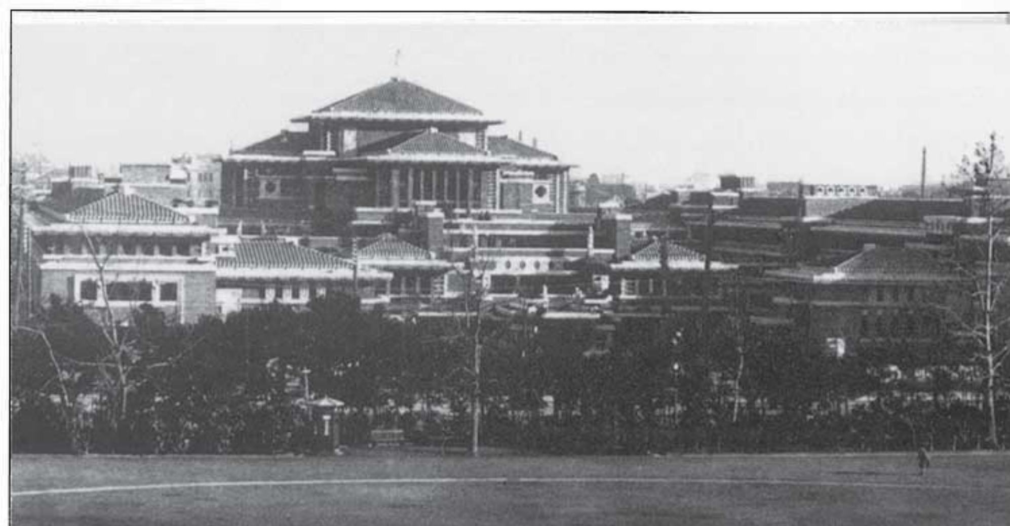
The Imperial Hotel, still standing, after the great earthquake of 1923.

The documentary interweaves historical details, events in Wright's career, his soap-opera-like personal life, and fourteen buildings designed and/or constructed in Japan, as well as buildings by his followers. Japan's welcoming of foreign experts and technology in the latter nineteenth century set the stage for Western-style architecture often built of imported brick and in eclectic combinations of Western styles.